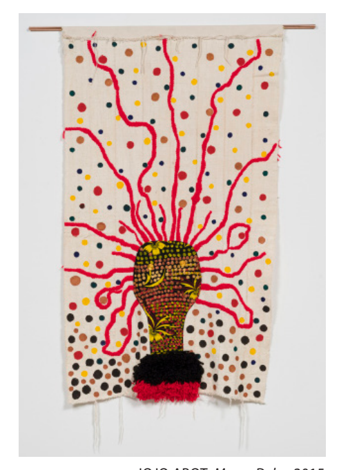
JOJO ABOT, Mawu Deka , 2015 Bogolan , acrylic, yarn , beads 66 x 41 x 2 in (167.6 x 104.1 x 5.1 cm)