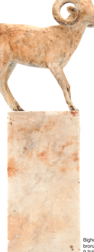
Bighorn Maquette, 2009 bronze 9 3/4 x 11 x 4 1/4 in.

The Wrasslers 3, 2006 bronze 4 1/4 x 5 1/4 x 5 in.