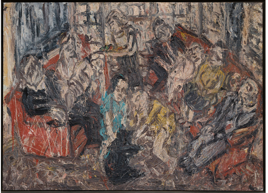
Leon Kossoff, Family Party, January 1983, 1983 Oil on board, 66 x 98 1/4 in. (167.6 x 249.6 cm)

Frieze Los Angeles February 17 - 20, 2022 Booth D8