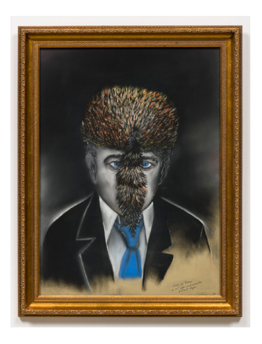
Terry Allen, Pioneer, 1990 mixed media on paper, 34 1/2 x 26 5/8 in. (87.6 x 67.6 cm)

45 N Venice Blvd Venice CA 90291 info@lalouver.com 310 822 4955 lalouver.com/appointments