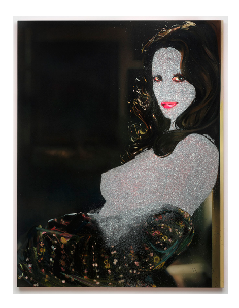
Rebecca Campbell, Glitter Girl, 2015 oil on canvas, 84 x 65 in. (213.4 x 165.1 cm)

45 N Venice Blvd Venice CA 90291 info@lalouver.com 310 822 4955 lalouver.com/appointments