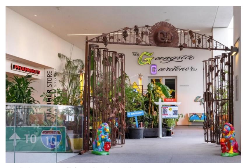
Installation view Breath(e) exhibition installation view Hammer Museum

One of my favorites among the shows I previewed is an installation, Mark Dion: Excavations , at the La Brea Tar Pits Museum. Dion immersed himself in all aspects of the work of the museum, and eventually produced detailed works that appear as drawings of fossils that Dion has created to detail taxonomies of Los Angeles, including of LA bands, neighborhoods, celebrities... in ways that are idiosyncratic, funny, and will no doubt provoke differences of opinion.