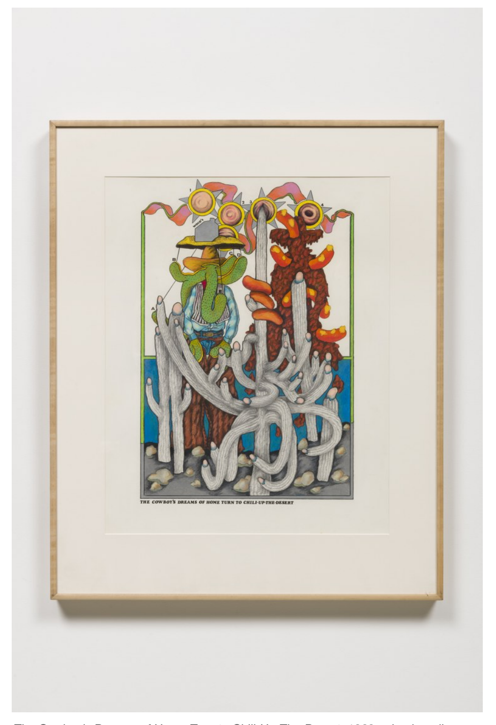
The Cowboy's Dreams of Home Turn to Chili-Up-The-Desert, 1969. mixed media on paper. 38 1/4 \times 31 \times 1/4 \times 13/8 in. (97.2 x 79.4 x 3.5 cm). © Terry Allen. Courtesy of L.A. Louver, Venice, CA.

He was encouraged by slightly older artists like Ed Ruscha and Billy Al Bengston who had similar Western backgrounds and who had attended Chouinard, as well. Allen was already writing songs and he performed his own country-style Redbird on a 1965 episode of the TV show Shindig. His solution was to consider his songs and his visual art parallel but equally considered pursuits.