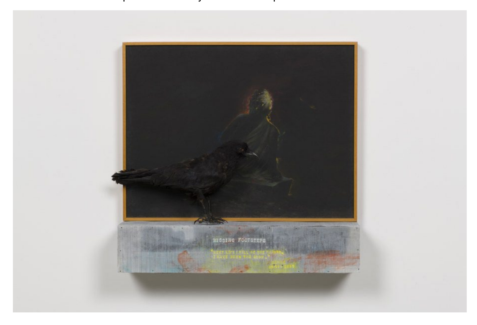
Missing Footsteps, 1988. mixed media. 22 1/2 x 23 1/2 x 5 1/2 in. (57.2 x 59.7 x 14 cm). © Terry Allen. Courtesy of L.A. Louver, Venice, CA.

(Recently, it was praised by Kurt Vile as a masterpiece.) Juarez was revisted almost twenty years later when Allen staged Crossing the Razor, an event on the Juarez/El Paso border with two platforms that enabled people from the United States and Mexico to talk to each other and even play music, interacting with one another across federal boundaries. It's a piece very much of our times but Allen's politics are always rooted in the personal.