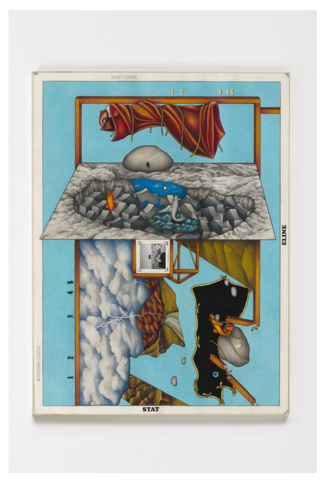
Stat Eline (Juarez), 1971. mixed media on paper and plexiglass. 30 1/4 x 40 1/2 in. (76.8 x 102.9 cm). © Terry Allen. Courtesy of L.A. Louver, Venice, CA.

(Recently, it was praised by Kurt Vile as a masterpiece.) Juarez was revisted almost twenty years later when Allen staged Crossing the Razor, an event on the Juarez/El Paso border with two platforms that enabled people from the United States and Mexico to talk to each other and even play music, interacting with one another across federal boundaries. It's a piece very much of our times but Allen's politics are always rooted in the personal.