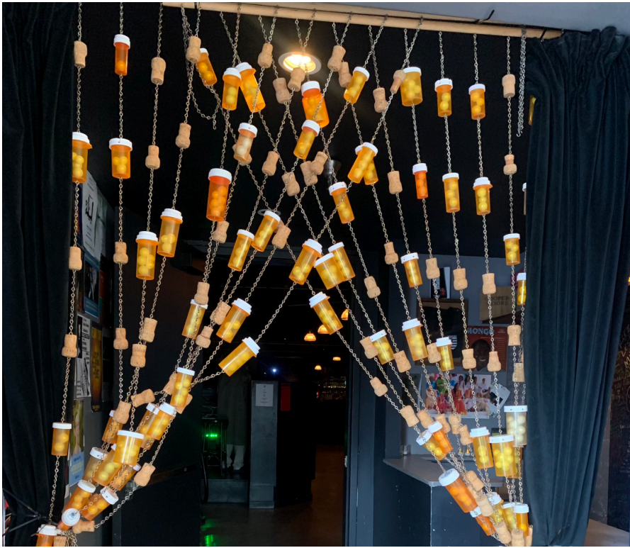
The Wrinkle Room's "Pill Bottle Curtain" by Tawny Featherston