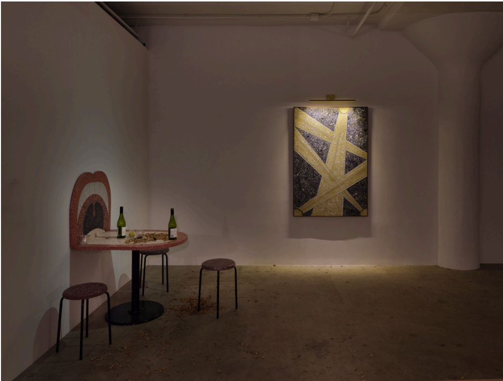
Installation view of Los Angeles Bar at In Lieu / Ethan Tate Gallery