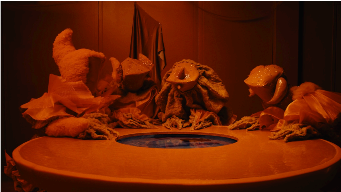
Still from Red Night (2023)