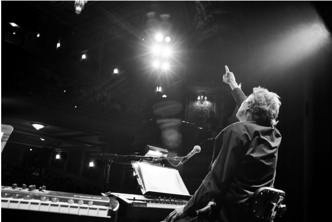
Terry Allen performing at the Paramount Theatre, Austin, TX, 2019