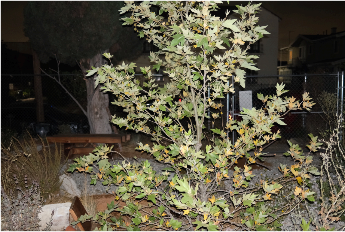
David Horvitz's garden