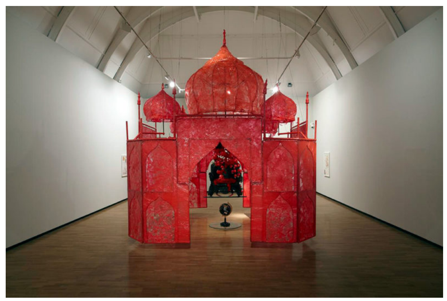
Rina Banerjee, Take me, take me, take me ... to the Palace of love, 2003. Plastic, antique Anglo-Indian Bombay dark wood chair, steel and copper framework, floral picks, foam balls, cowrie shells, quilting pins, red colored moss, antique stone globe, glass, synthetic fabric, shells, fake birds. 161.4 × 161.4 × 226.4 inches.

South Asians' racist attitudes toward other brown minorities. I was often confused for, or inaccurately categorized as, Mexican, Filipina, Tibetan, and so on. South Asians were in crisis over this slippery identification that white Americans had activated around the color brown.