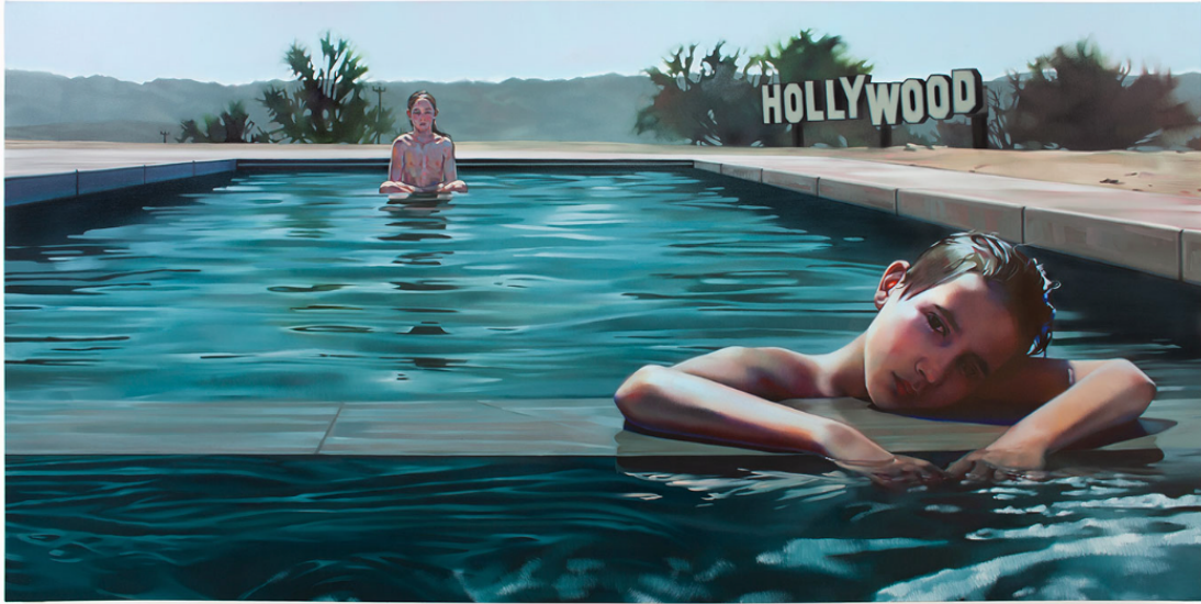
Hollywood Is a Sign

Two large paintings set the stage. Greenhouse and California Love (both 2023) are exteriors. In California Love , Campbell portrays a fruit tree surrounded by flowers. Behind a wooden fence are palm trees. In the foreground, colorful plants appear to dance in the magical light. This is the California dream. Although the painting is devoid of people, the human presence abounds — as gardener and appreciator of California’s unique light. Greenhouse celebrates Campbell’s excellence as a painter and as an observer of domestic life. Here she presents the family home — a green house with a balcony that is surrounded by plants and trees. A mix of styles inhabits the surface ranging from highly detailed renderings to blurred abstraction in addition to thick applications of paint. With Campbell, every stroke, gesture, area of color and expression is deliberate and purposeful. In Greenhouse , she allows three isolated figures— a painter on the balcony, a silhouette in an upper window and a shoeless youth seated on a wall at the edge of the home’s back stairs to exist in their own worlds, connected and disconnected simultaneously.