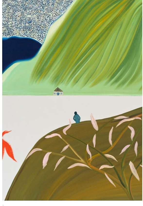
Witnessing is what the

You enter a darkened room. South African artist Gabrielle Goliath's installation is a somber witnessing. Two videos are projected on screens, which join a wall of names (an homage) and midnight-hued pillows on which to watch and listen in silence.