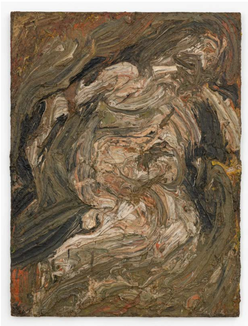
“Seated Nude No. 1,” from 1963, oil on board.

The painter’s subjects fall into two main groups. There are self-portraits as well as portraits of friends and family and paintings of nude models — all made during long sessions in his studio. Then there is everything outside, namely London and its pulsing life. This he captured in paintings of construction sites; pedestrians passing well-known buildings or entering tube stations, as well as trains racing along tracks. These began as numerous drawings made on location, from which he painted in the studio.