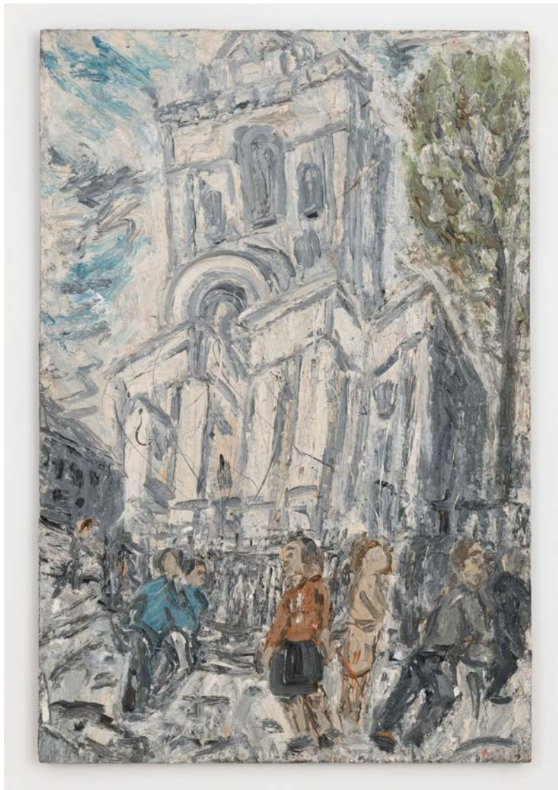
"Christ Church, Spitalfields, Early Summer," Kossoff's 1992 rendering of Nicholas Hawksmoor's English Baroque masterpiece.

By now, Kossoff is among the most accomplished painters of the late 20th and early 21st century. He has been unfairly overshadowed by fellow Brits like Francis Bacon and Lucian Freud, thanks in part to their colorful personal lives. But this may pass.