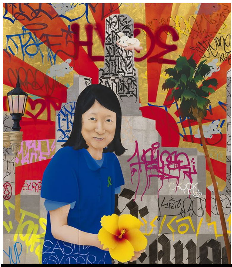
Forget Me Not (Chitose Fujita), 2023 by Gajin Fujita (silver leaf, palladium leaf, 23.75K gold leaf, spray paint, Sakura streak marker, and paint markers on three wood panels, 72 by 60 inches).

Paintings and drawings in True Colors harken back to the social and political climate of the past three years.