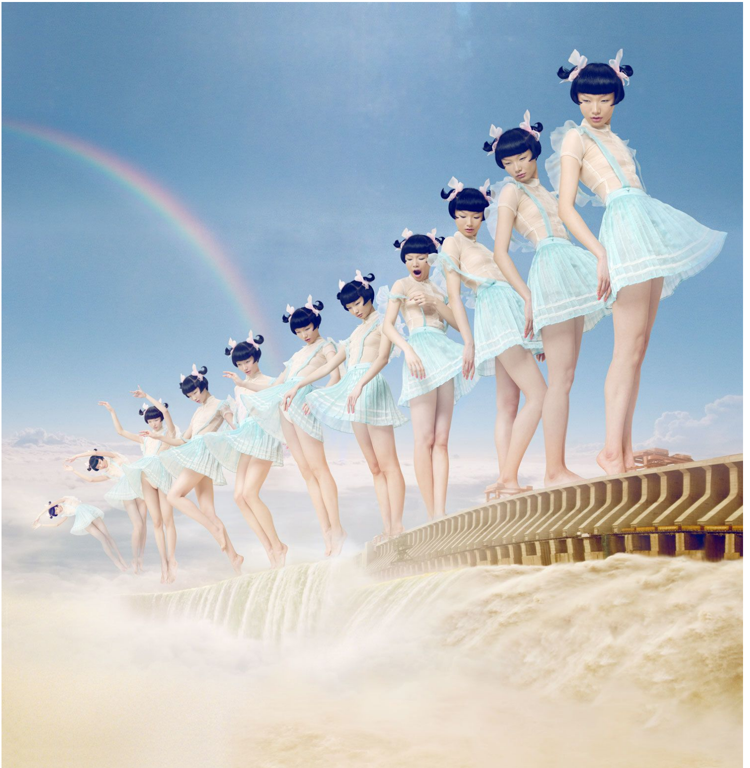
Young Pioneers with Three Gorges