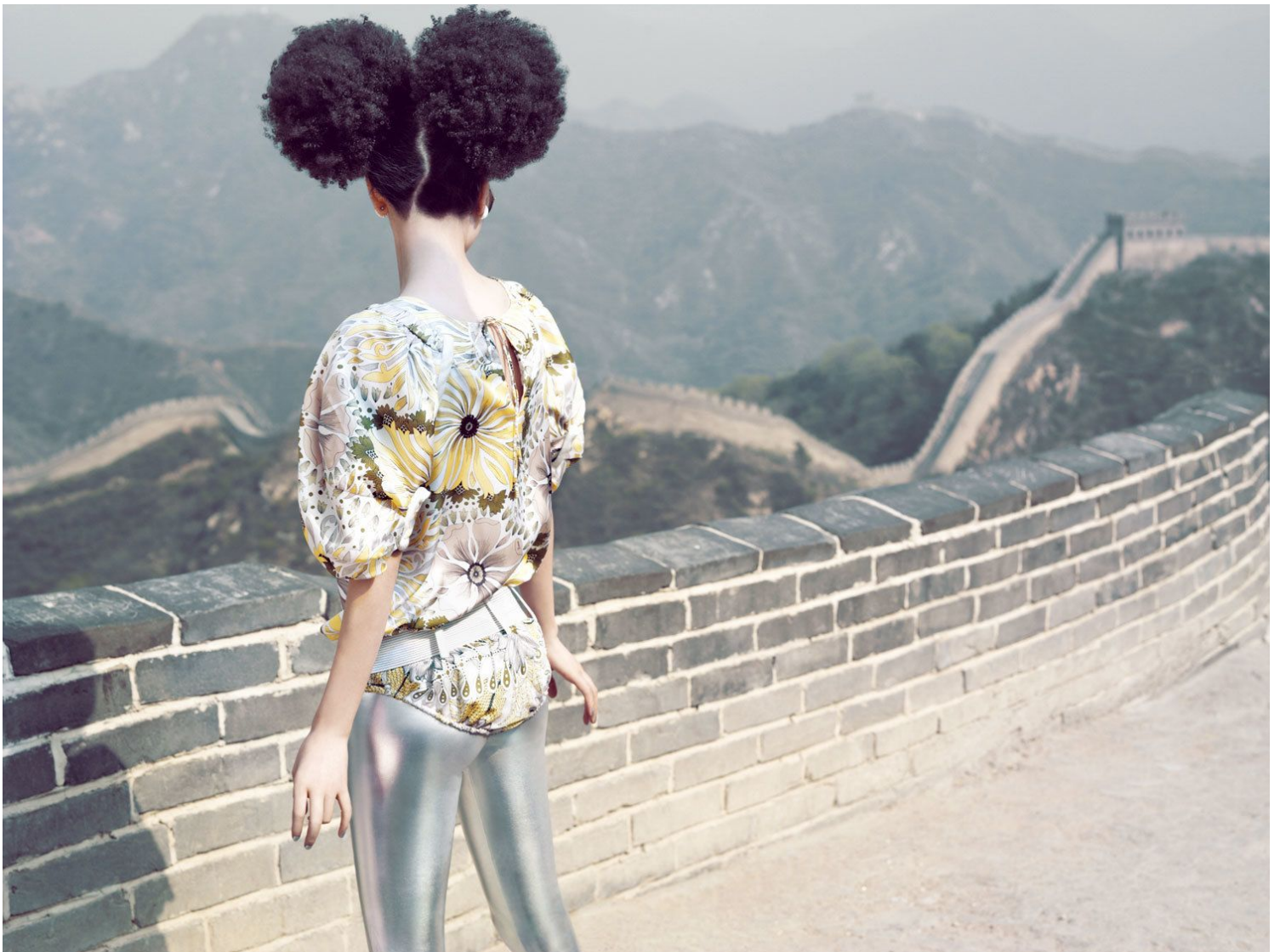
Funky Great Wall

While most Chinese photographers are still imitating their Western counterparts in exploring their individual styles, I look to China for inspiration. This is most clearly expressed in my Motherland series (2008). This series is very special to me, being the first photographer to use iconic Chinese locations as backdrops in fashion photography. Rather than repeating typical representations of China, I wanted to illustrate what Chinese beauty looks like in a contemporary context.