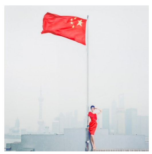
Chen Man, Long Live the Motherland, Shanghai No. 1, 2010, Diasec mounted C-print, 51 7/8 x 51 1/2 in. (131.8 x 130.8 cm), Copyright Chen Man. Courtesy of L.A. Louver, Venice, CA. This image was shot for the Shanghai Expo and became the cover for a book. Chen Man says "Chinese people think I produce heavily retouched fashion photography, but this image is not retouched. This area was quite high and I just caught the moment."

So if her work is on one hand a blatant celebration of bling (while displaying a new reverence for Chinese female beauty), on the other she see it as a vehicle to explore ancient Chinese philosophies — Buddhism and Taoism — and protection for the environment of a "universal" Earth.