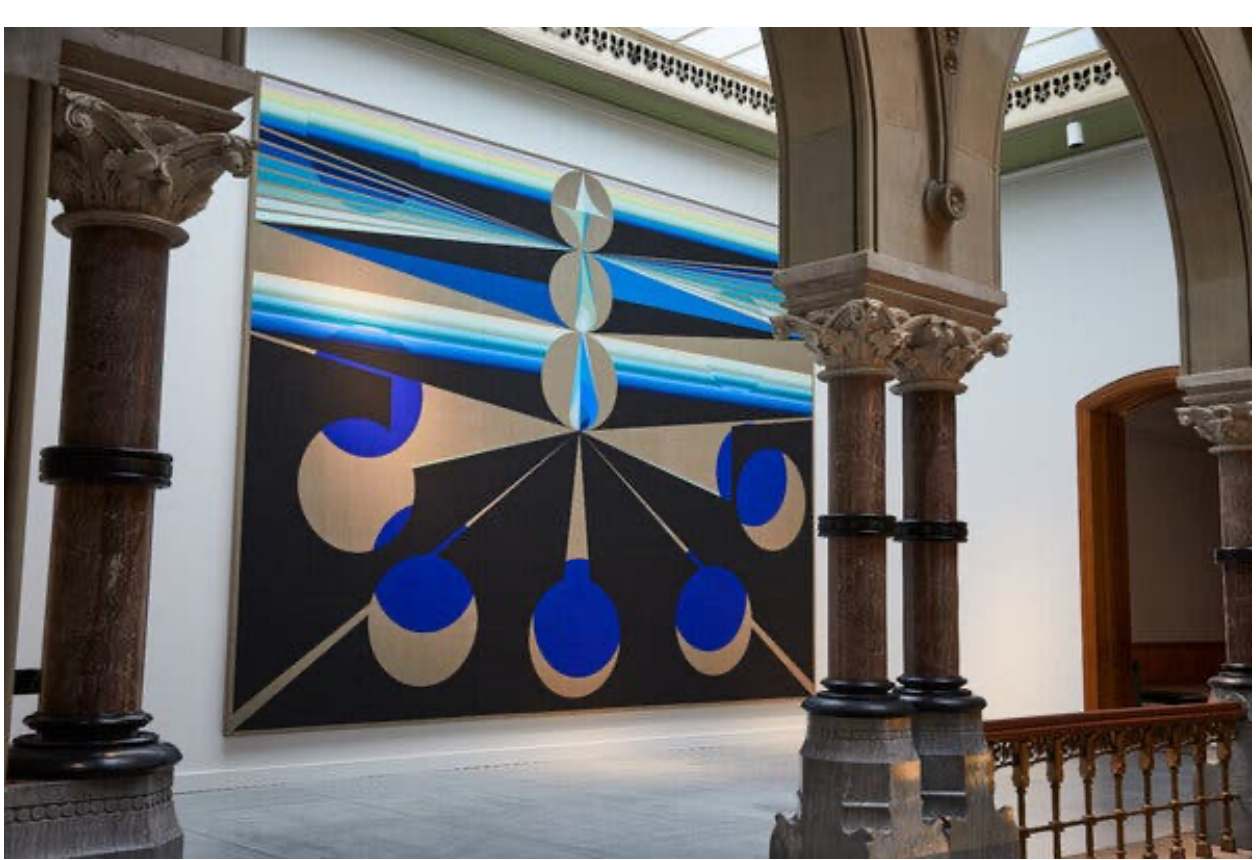
"Black Medallion XIV (Inti)" (2022) by Eamon Ore-Giron at the top of a stair at PAFA.

"These works are meant to position the viewer in a space where they are interpreting dawn and dusk," said Ore-Giron, who has depicted both transitional moments as fundamentally similar rather than opposite. "America's filled with this weird duality. To me this two-part exhibition structure just reinforced the idea of perspective."