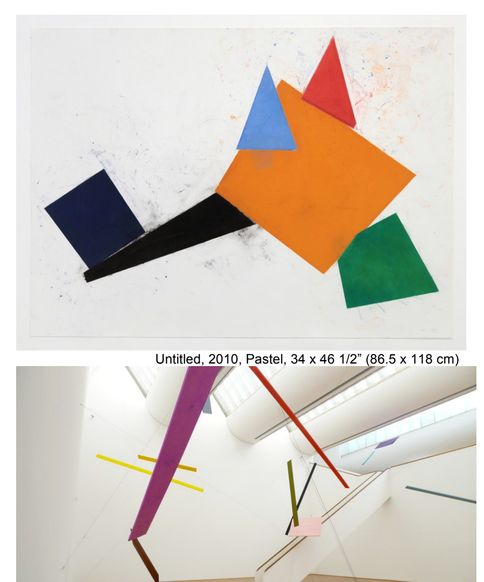
Installation view: Museum Ludwig, 2011

Last question -- If you could give young artists one piece advice on achieving longevity in the art world, what would it be? Keep working.