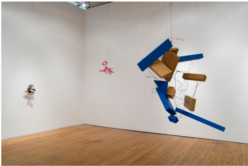
Installation view: Texas Gallery, 2008