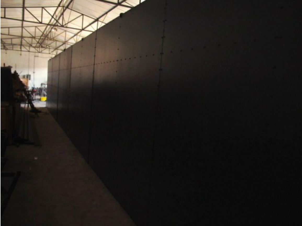
Sui Jianguo- Restricted Motion, 2010; 250 x 250 x 800cm