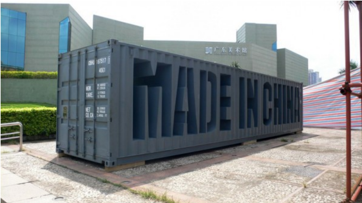
Made in China 02, 2011; Steel container, 1200x270x240cm