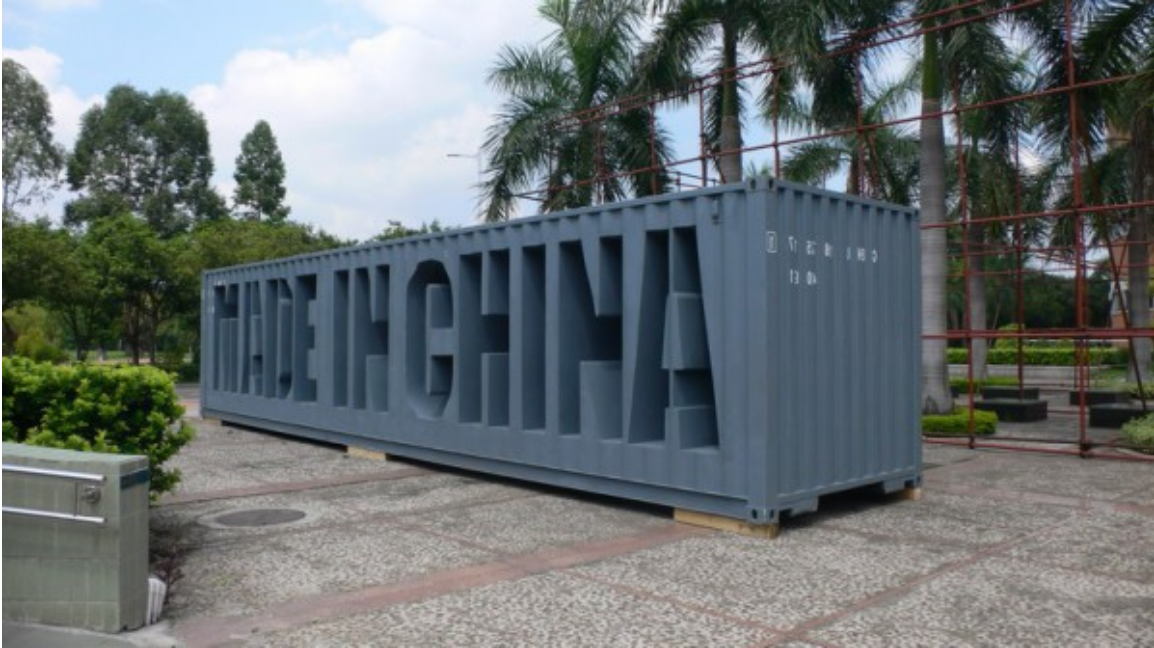
Made in China, 2011; Steel container, 1200x270x240cm