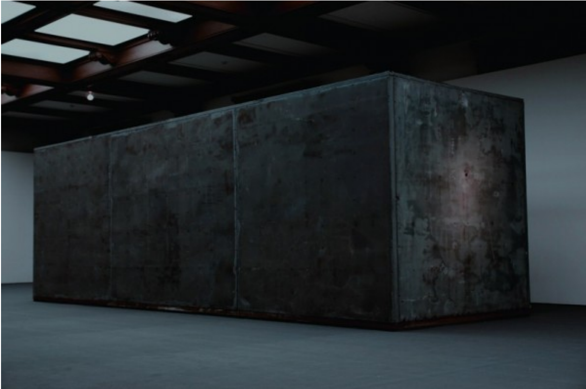
Sui Jianguo- Restricted Motion 02, 2010; 250 x 250 x 800cm

structure with a total weight of 8 tons and is a 2.5 meters high, 2.5 meters wide and 15 meters long sealed box with a wall thickness of 5 mm and an iron ball 2 meters in diameter. The entire space occupies a considerable proportion of a metal cargo container and from the iron ball the audience can hear the continuous constant rattle from the associated power device drivers, and every 27 seconds or so, there are deafening percussive noises in the metal cargo containers. From within the structure escapes the crashing sound of steel-on-steel collisions that send reverberations through the floor. When looking through one of the two viewing ports in the structure, the viewers catch fleeting glimpses of the huge steel ball rolling about within.