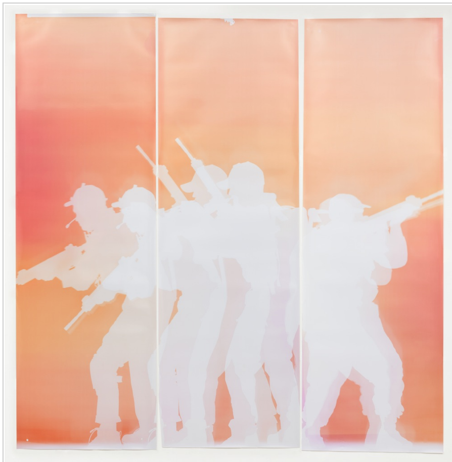
Farrah Karapetian, Muscle Memory , 2013, unique chromogenic photograph (from performance), Three panels, each: 108 x 35 in. (274.3 x 88.9 cm)

38 people like this. Be the first of your friends.