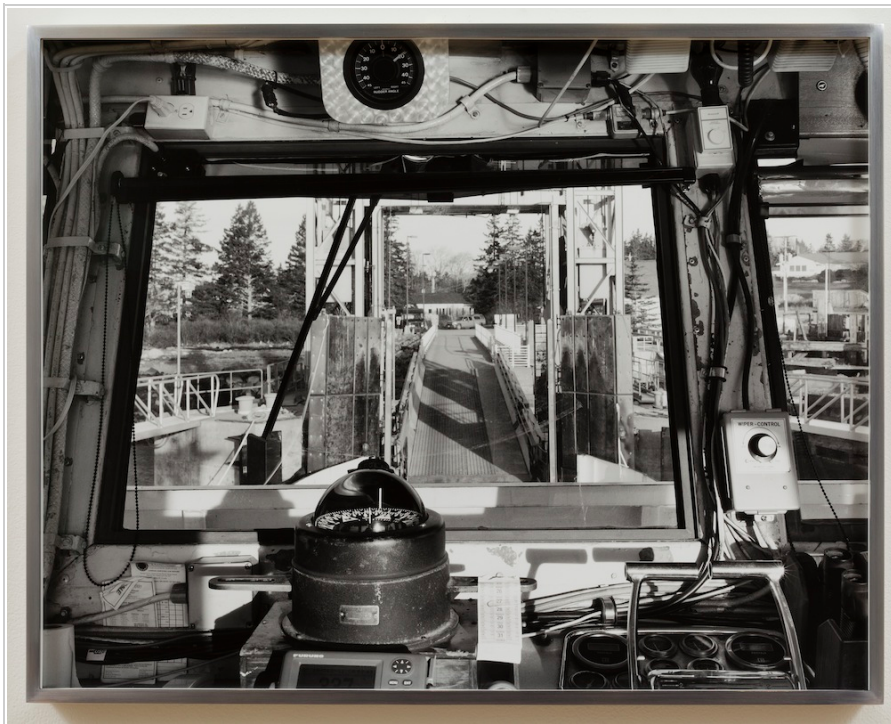
Peter Holzhauer, Wheelhouse , 2012, gelatin silver print 17 1/4 x 22 in. (43.8 x 55.9 cm), Framed: 17 5/8 x 22 1/4 in. (44.8 x 56.5 cm), Edition 1 of 6 signed, dated, and numbered, verso.

MOCA, Nassau County Art Museum, Kravets/Wehby Gallery, L.A. Louver, Lawrie/Shabibi Gallery and Marc Selwyn Fine Art among others.