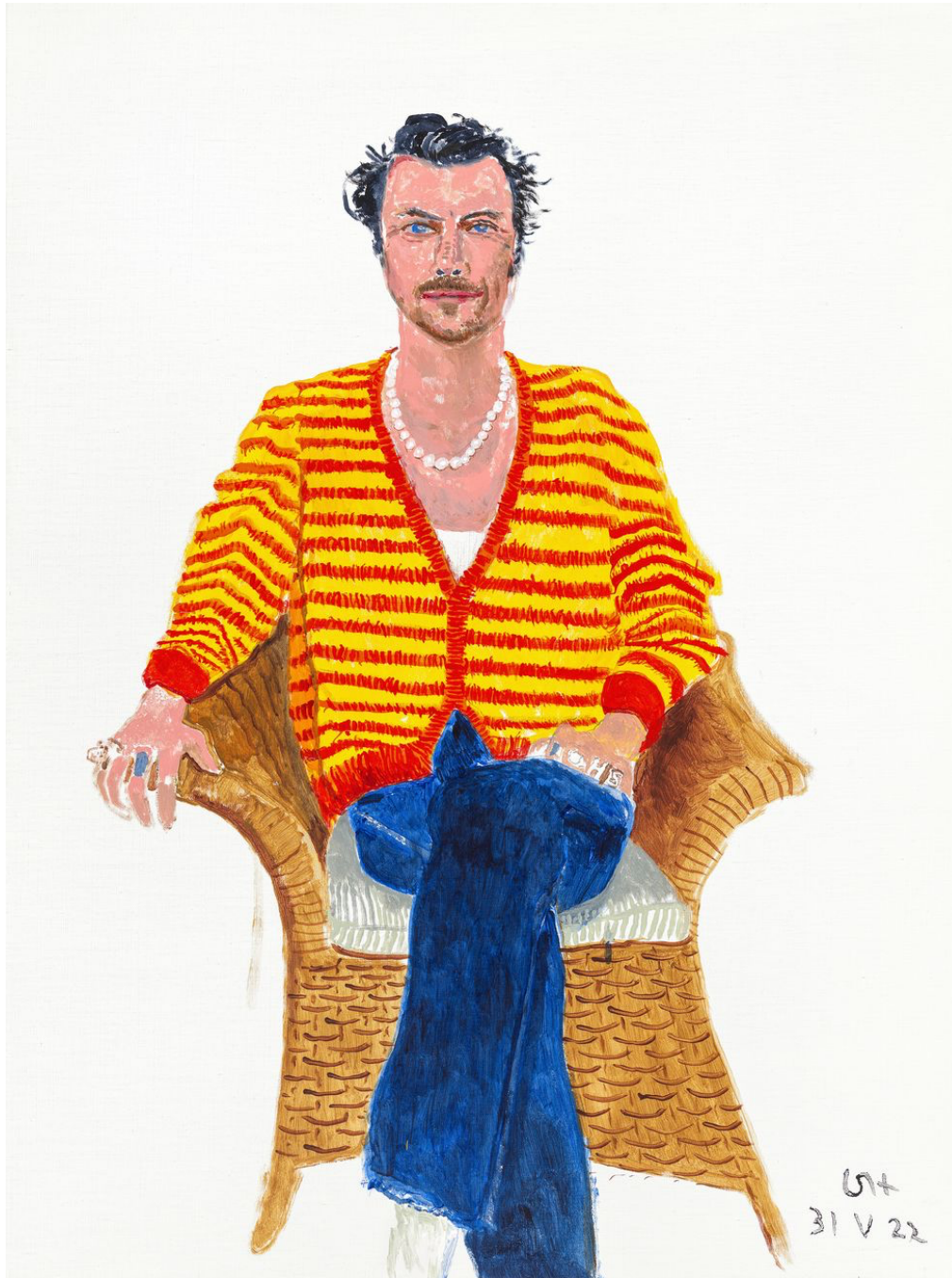
David Hockney, Harry Styles, May 31st, 2022. Acrylic on canvas 121.92 x 91.44 cm (48 x 36 inches).

Hockney tells Vogue , "I wasn't really aware of his celebrity then. He was just another person who came to the studio." Styles, a huge fan of the artist, said, "David Hockney has been reinventing the way we look at the world for decades. It was a complete privilege to be painted by him."