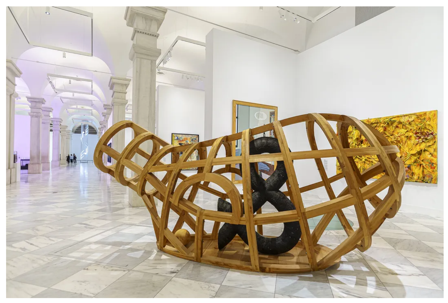
Of the nearly 100 works in its initial reopening exhibition, "American Voices and Visions," 52 percent are by artists of color and 42 percent by women. Albert Ting

One of the museum's most popular pieces, Nam June Paik's 1995 Electronic Superhighway: Continental U.S., Alaska, Hawaii —a pulsing map of the 50 states lined with 575 feet of multicolored neon tubing, with each state defined by flickering video from 336 televisions and 50 DVD players—is now accompanied by revolving examples from the museum's substantial archive of the artist's work.