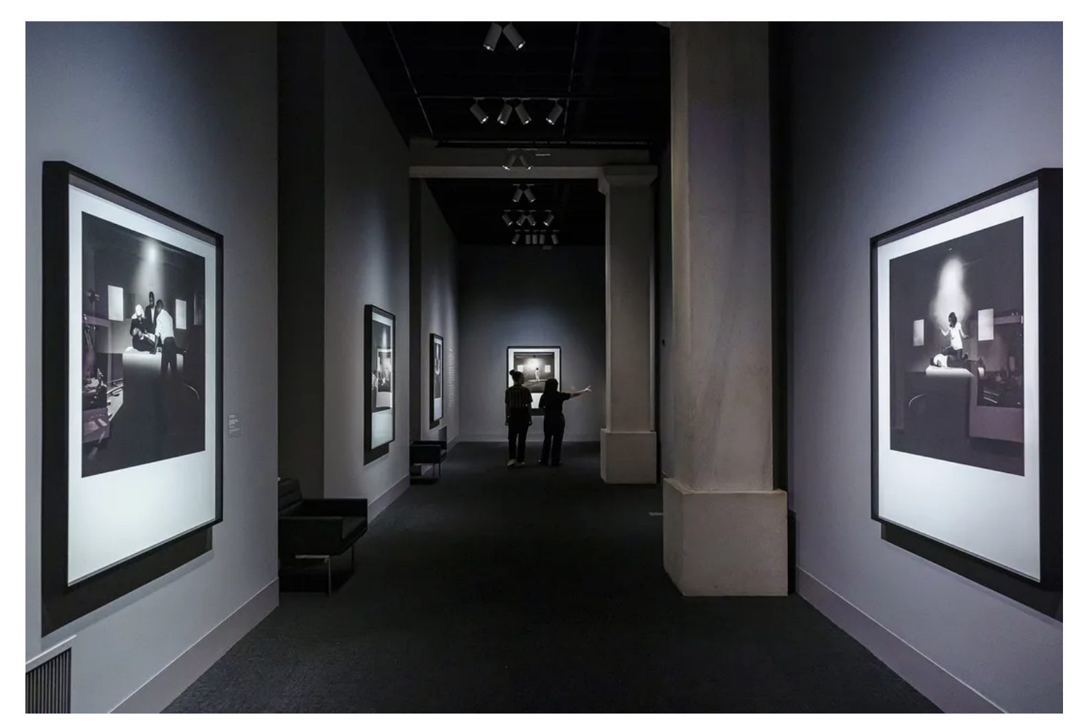
The video installation is accompanied by eight photographs from Weems' "Constructing History" series.