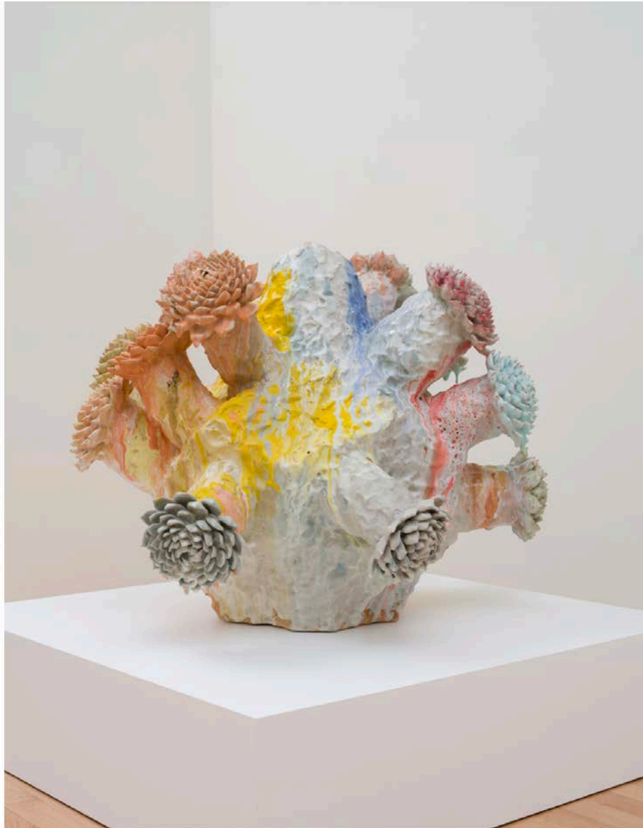
Flower Tree, 2022