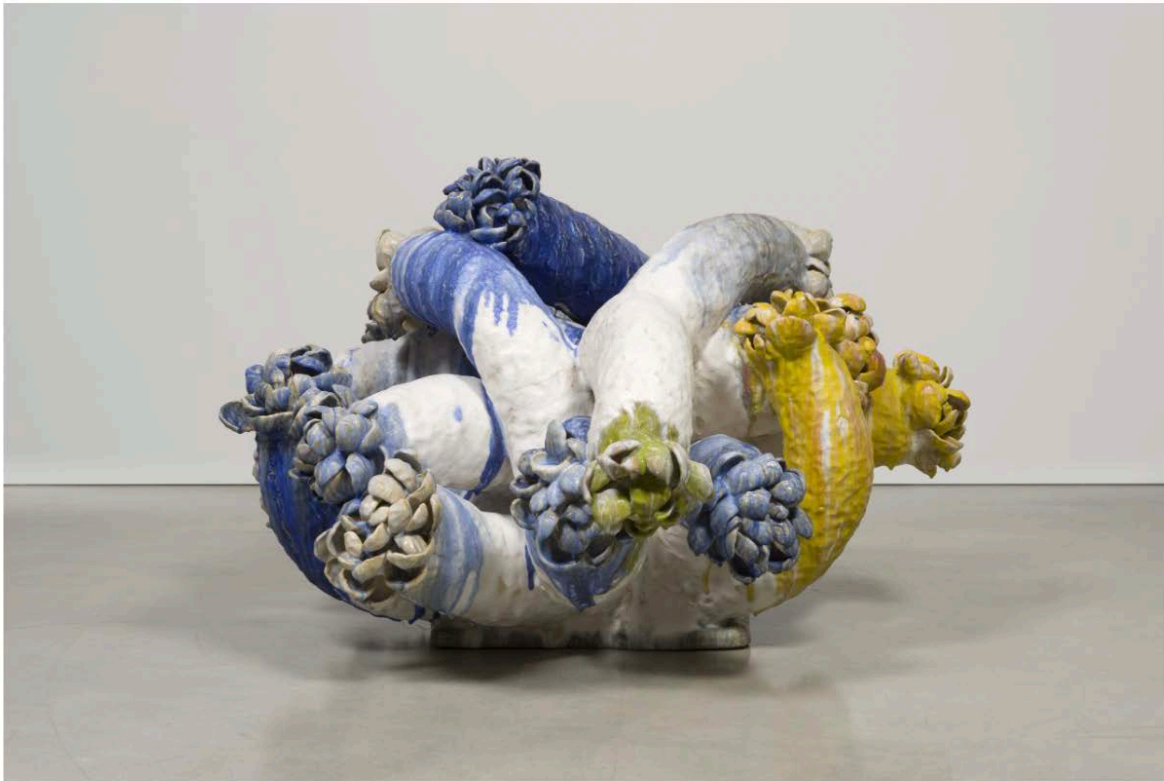
Flower Tree, 2014; photo by Jeff McLane.

What makes you smile? Being in the garden, baking pies with lattice crusts, eating Morels , spreading milkweed seeds, opening a cooled kiln to find something I have never seen before.