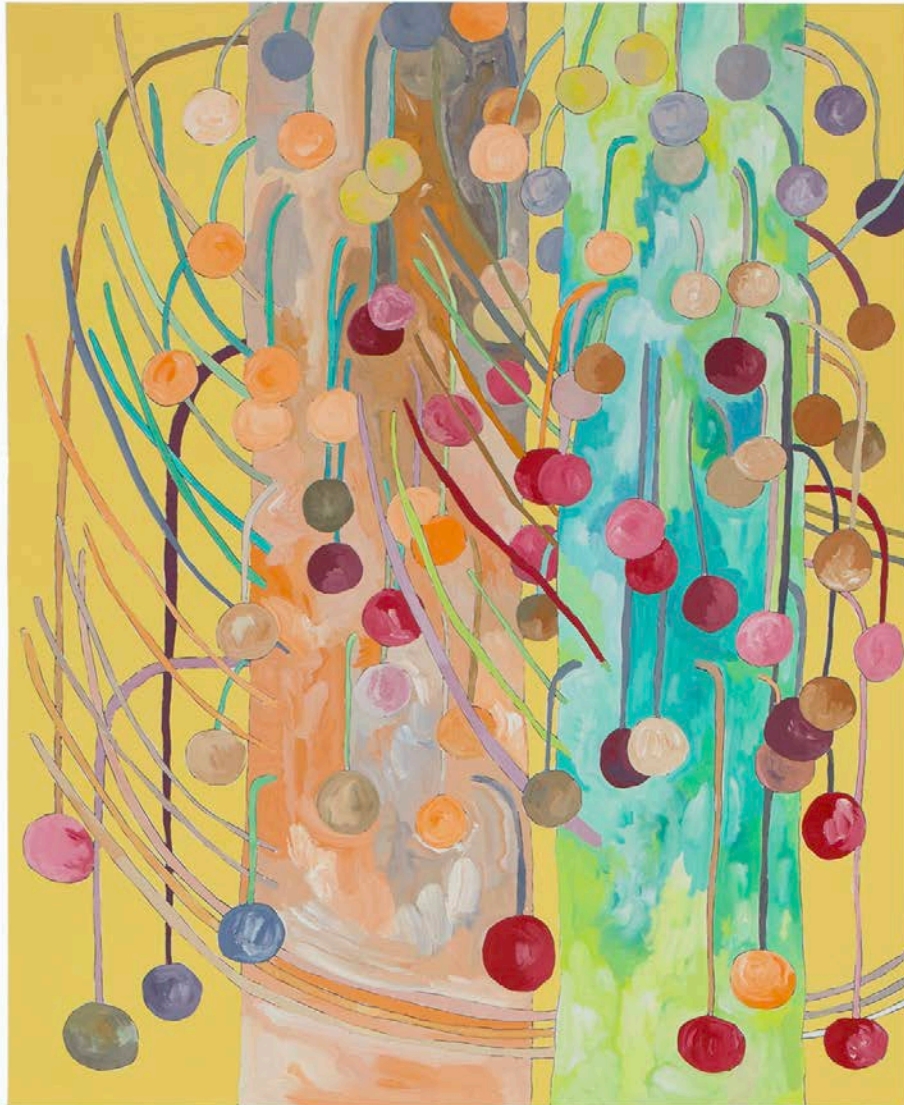
Flower Tree (Hawaii)

What TV series from your youth best describes your approach to life? “Care Bears” and “Sesame Street,” for sure. The idea that caring is the work we need to be doing. No matter what crazy shit we get into as a kid, this kind of image sticks with you.